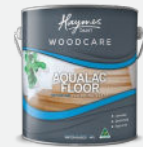
Woodcare Aqualac Floor