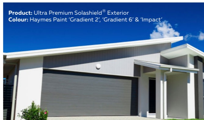
Product: Ultra Premium Solashield® Exterior Colour: Haymes Paint 'Gradient 2', 'Gradient 6' & 'Impact'