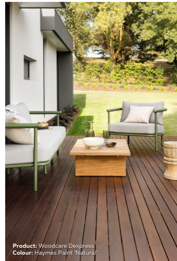
Product: Woodcare Dexpress Colour: Haymes Paint 'Natural'

Ultimate is our range of water-based, environmentally friendly, high-performance protective coatings that can provide protection particularly on garage floors, alfresco areas & patios. Also available in seamless flake flooring options.