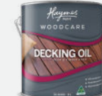
Woodcare Decking Oil