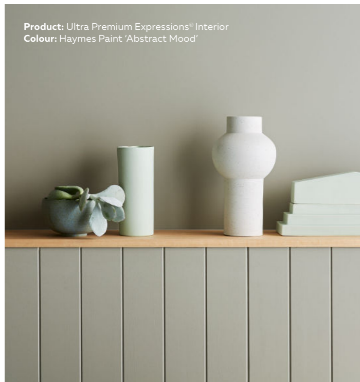
Product: Ultra Premium Expressions® Interior Colour: Haymes Paint 'Abstract Mood'