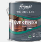
Woodcare UVEX Finish