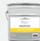
Rendertex Masonry Sealer