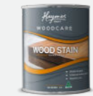
Woodcare Wood Stains