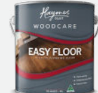
Woodcare Easy Floor Non-slip