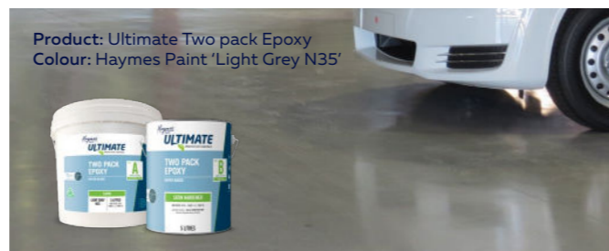
Product: Ultimate Two pack Epoxy Colour: Haymes Paint 'Light Grey N35'