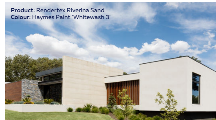
Product: Rendertex Riverina Sand Colour: Haymes Paint 'Whitewash 3'